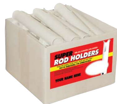
#ETH-24 DISPLAY BOX

HI-DENSITY POLY, U.V. INHIBITED LIFETIME GUARANTEE AGAINST BREAKAGE